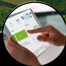
1 Individual ESG Analyses

Through our ESGx Portal, institutional investors get a birdseye view of portfolio companies' ESG progress in a single, organized location.