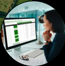
2 Portfolio-Wide Visibility