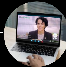
3 Personalized ESG Support